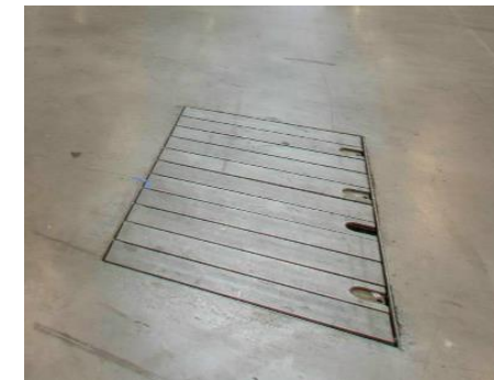
Technical duct on the floor