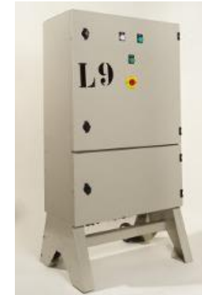
ELECTRICAL CABINET (from 30KW) L 45 x D 31 x H 98