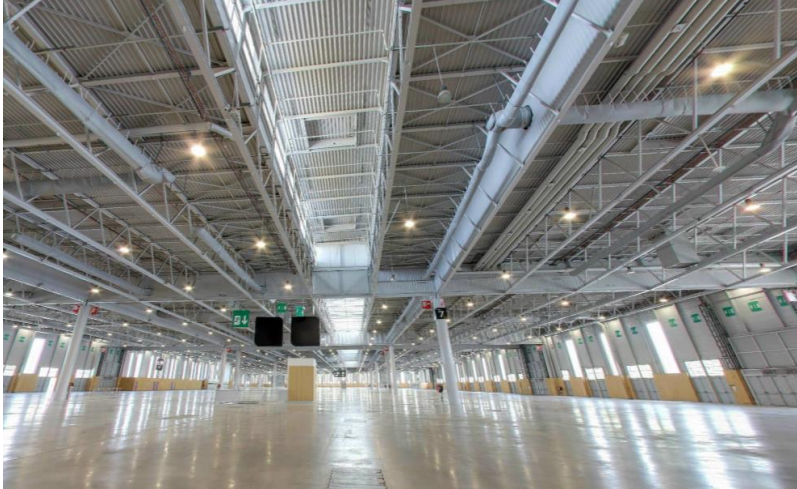
All floor is concrete